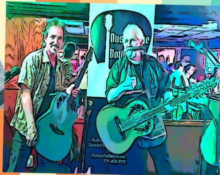
Dust on the Bottle